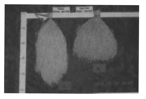
Figure 1: "Panjang" rice compared to the other local rice

"Panjang" rice showed lower ash, protein and lipid content compared to IR-42 rice. This indicates that the carbohydrate content of